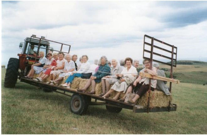
York Association members enjoy a visit