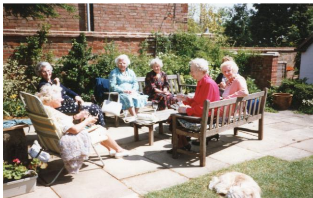
Meeting of members of the Warwickshire Branch 22/05/1990

The WVS/WRVS Association has to charge for its membership as it received limited support from the WRVS through the payment of the rent, electricity and telephone bills of the Association's office. At the first annual meeting it was decided that the subscription for membership would be £1 annually, of which 50p contributed to the WRVS Magazine, with life membership being £10.