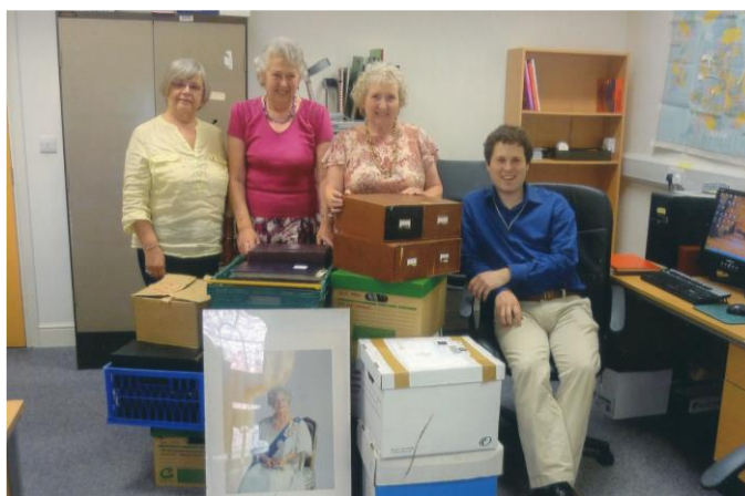
The WRVS Association Archive material being collected by the Archivist.

The WRVS funding of the Association was to cease after 2011, and although the Association felt it could potentially last up to two years without this support, it was decided to hold a secret ballot at the AGM to decide the Associations fate. There were declining membership numbers due to the death of members and the resignation of others for various reasons such as ill health and going in to care, with very few new members joining.