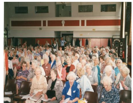
Members attending the AGM in York, 1990