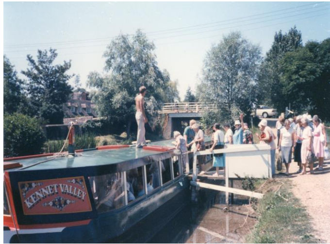
York Association members boarding a barge on Kennet and Avon Canal, July